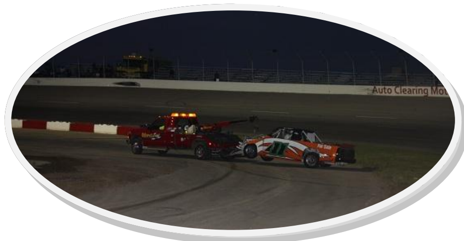
Leschenko's truck hauled into the pits

Complete Results and Points \standings: http://speednetdirect.com/results.php?track_id=8311