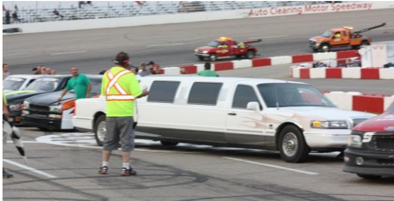
SKL Trailer Pro Truck Drivers are brought out in a stretch limo