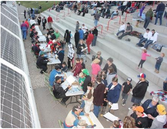
Fans line up for autographs with Dakota Dunes SLM Drivers