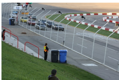
#82 Jonathan Neufeld can be seen approaching the line ahead of pole car #11 Alex Heintz in the Parts Source mini stock qualifier race

The penalty is a complete restart, with the car that jumps the line being moved to the back of the field.