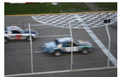
#88 Brad Wrennick can be seen well ahead of pole sitter #36 Darryl Potts in the Budget Car and Truck Rental street stock feature