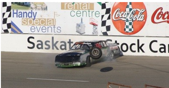
Kyle Roy loses a wheel during the Budget Car and Truck Rental street stock heat race, parking him for the night.