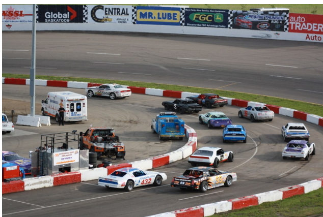
Budget Car and Truck Rental Street Stock heat race heading out to the track