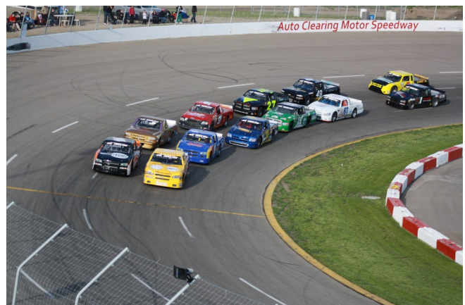
SKL Trailer Pro Trucks coming for Green