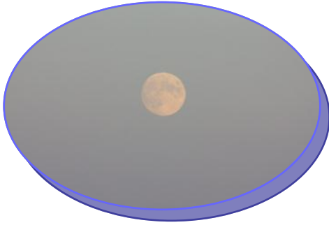
Full Moon Again!!