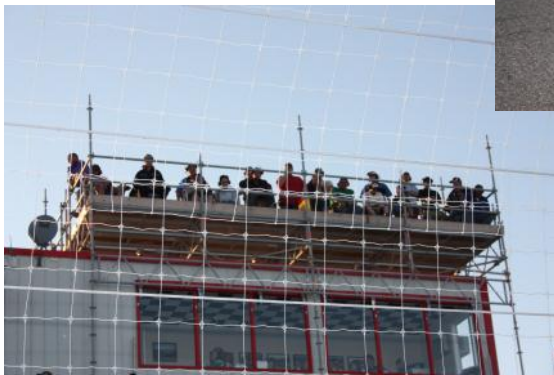
Spotters getting ready for the Black Sun 150