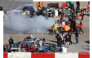
Track safety workers, sporting new colours thanks to Mark's Work Warehouse, relax before the action begins for what would be an extremely busy night for them