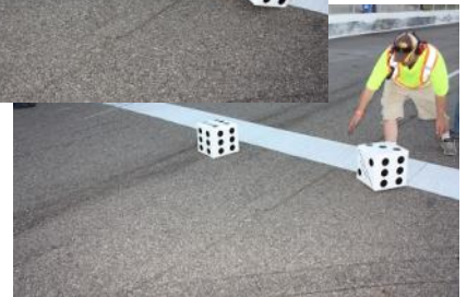
Rolling the Dakota Dunes Casino Dice