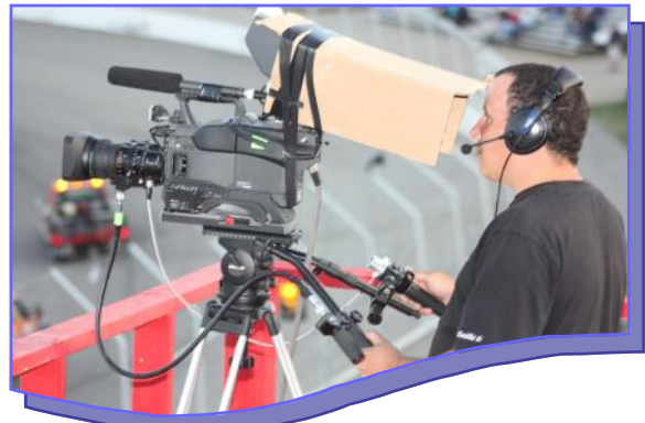
Tonight's race action will be on SaskTel Max local on demand television