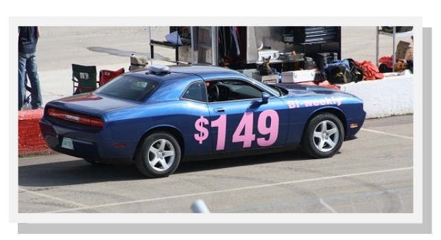
Temporary pace car from Auto Clearing Chrysler Superstore. The regular Challenger RT is in the body shop after a mishap at the dealership.