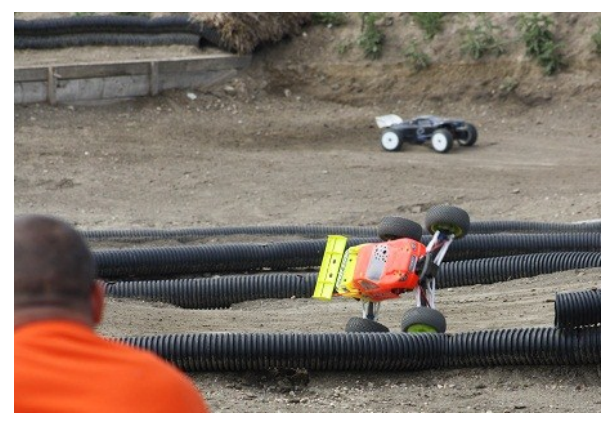
Action at the Saskatoon Radio Control Car Club track in the ACMS Parking Lot