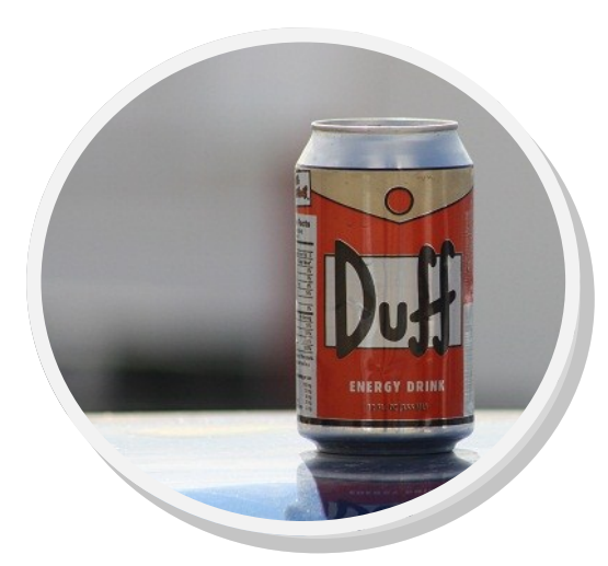
Ever wonder what powers the #19 street stock?