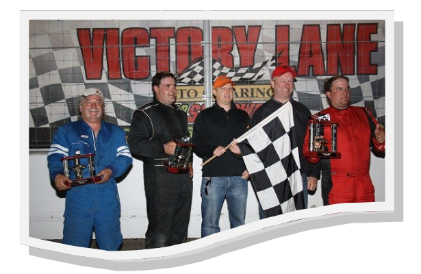
Winners Line Up